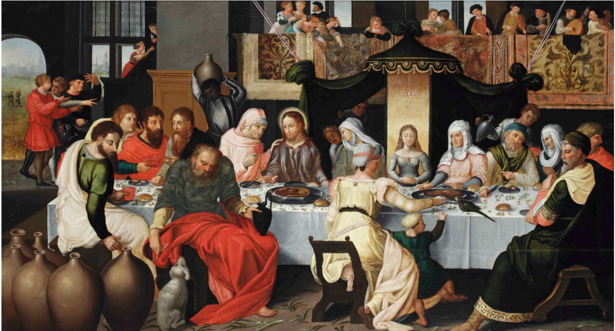
Image from Flemish School in 16 th Century.