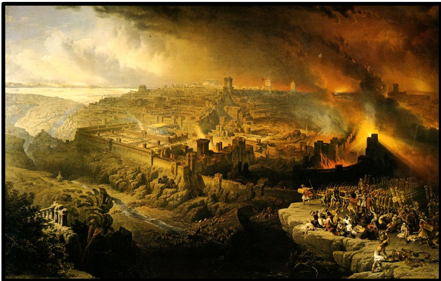
The Siege and Destruction of Jerusalem by the Romans A.D. 70, David Roberts 1850

Collection of Yeshiva University Museum.