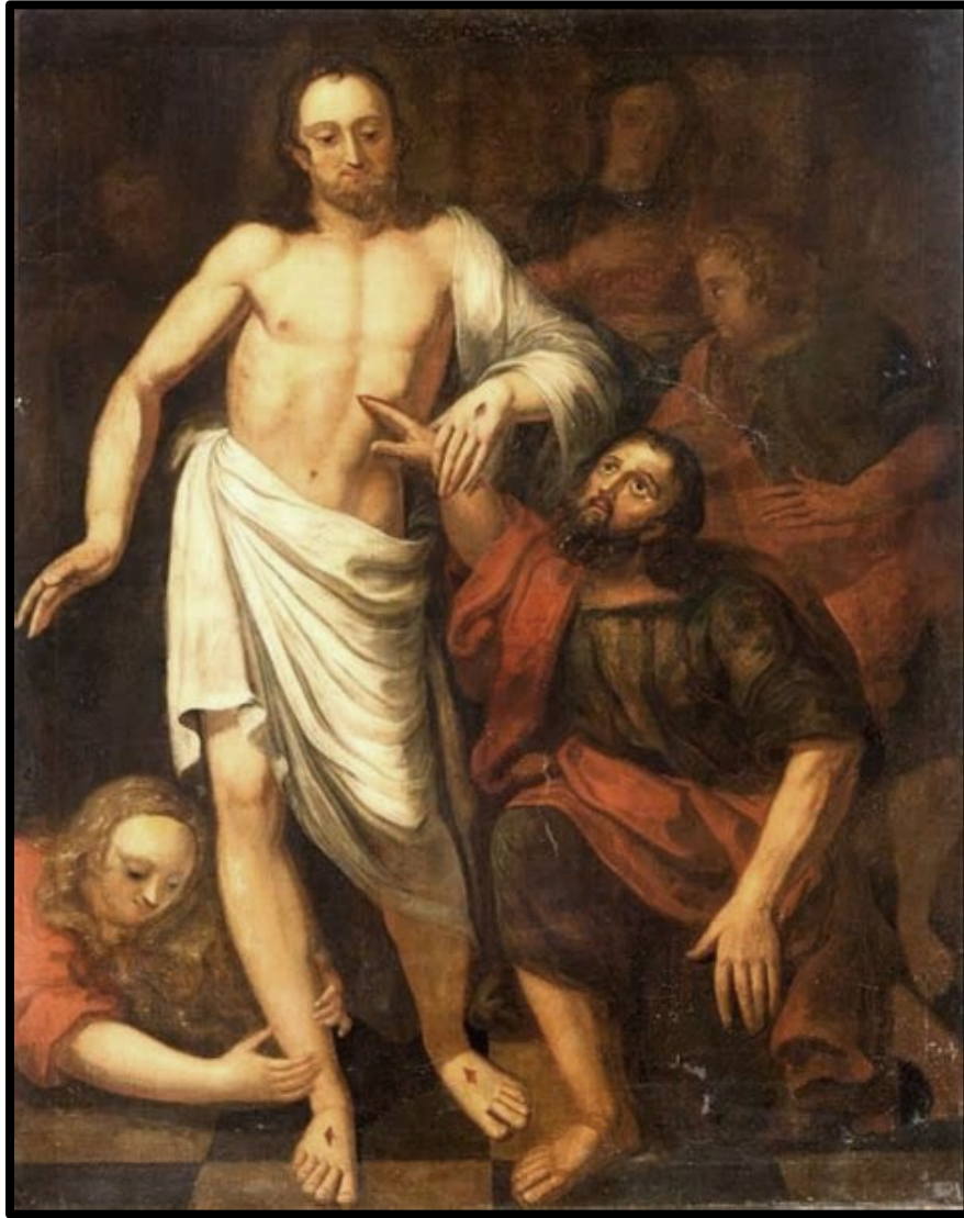
Painting by John Valentine Haidt